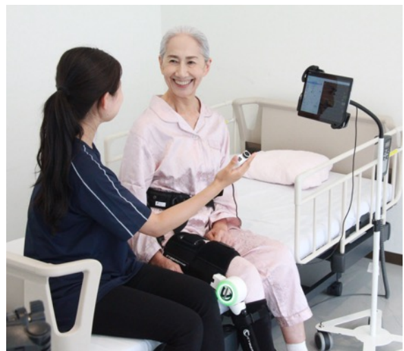
Acute stage – knee bending and stretching – seated position

Start rehabilitation early and aim for an early recovery