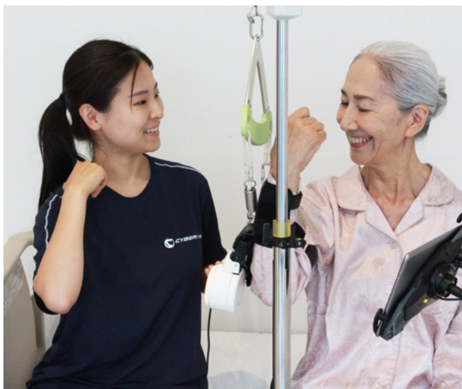
Acute stage – elbow bending and stretching- supine position

By switching attachment parts, one unit can be put on both elbow and knee