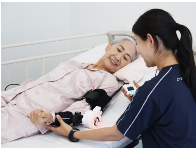
Acute stage – elbow bending and stretching- supine position